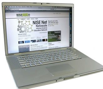
Laptop with liquid crystal display

The way a material behaves on the macroscale is affected by its structure on the nanoscale. Changes to a material's molecular structure are too small to see directly, but we can sometimes observe corresponding changes in a material's properties. The liquid crystals in this activity change color as a result of nanoscale shifts in the arrangement of their molecules.