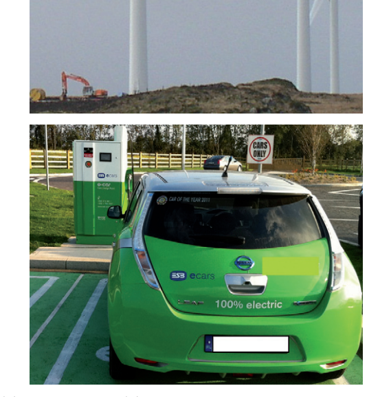
Fig. 1 (a) Wind turbine and (b) plug-in electric vehicle.

the electricity demand is normally low and electricity from wind may otherwise be wasted. The primary disadvantage of the EV is the battery, which has a relatively short lifetime, a long recharging time and results in a short driving distance per charge.